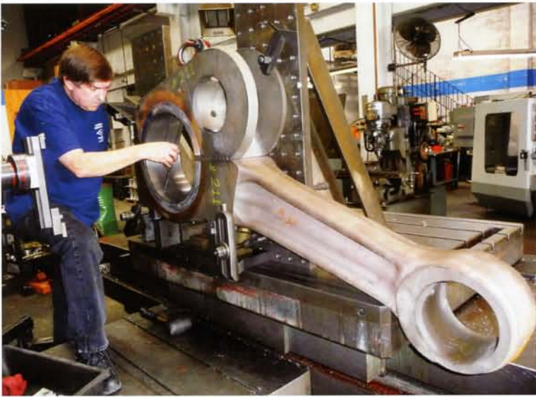
Connecting rod for a diesel engine.