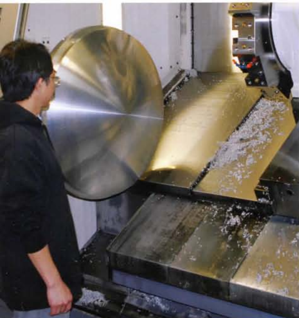
34" Spherical Dome on our LB45

“The Mummy” ride at Universal Studios in Orlando Florida. (Miscellaneous parts for robots such as fingers, feet, jaws and eyeballs.)