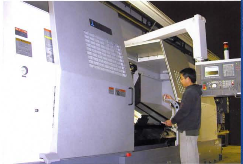
Our newest Okuma LB45.

Diamond Tool and Die uses a combination of Mastercam™, Geopath™, Pathtrace™ and Calypso™ software, giving us the ability to work with most file formats.