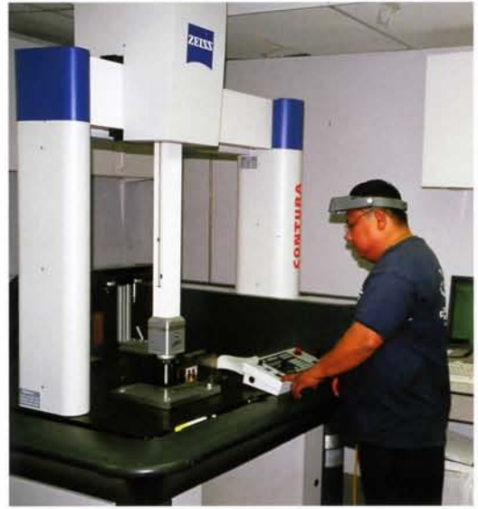
Operator inspecting parts on our Zeiss Contura.