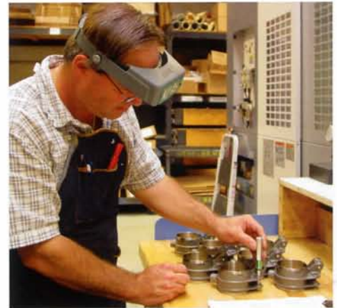
Investment castings being machined and inspected.

What makes us stand out from other machine shops is that we are employee owned and operated, so our employees care more about your projects.