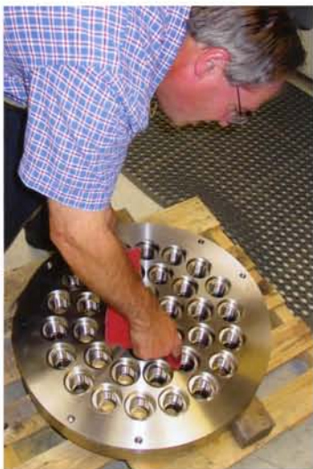
Preparing Pressure Vessel Component for inspection.