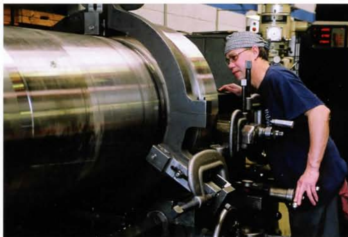
The machining of a pressure vessel

In the early 1980's, Diamond Tool and Die had built its first of six buildings and had grown to fifteen employees. DTD introduced a gas purifying product line known as LabClear™ and began a tooling distributing company known as The Tool Crib. In the late 80's DTD merged with another machine shop