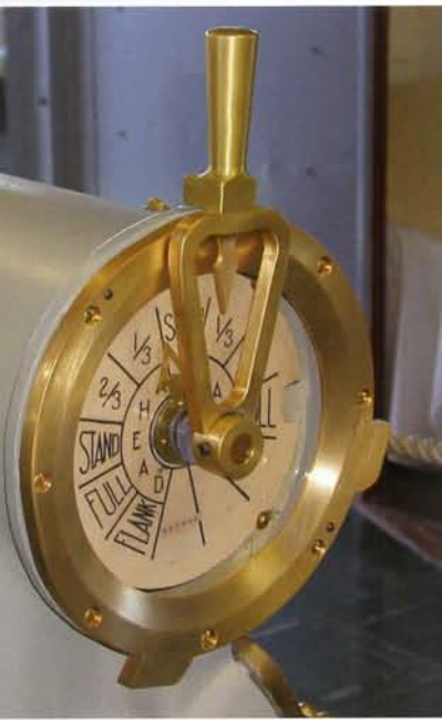
Restoration of the ship's telegraph on the U.S.S. Hornet .

known as ApSCO Manufacturing, became an ESOP (Employee Stock Ownership Plan), and introduced a moisture trap product line known as OxiClear™.