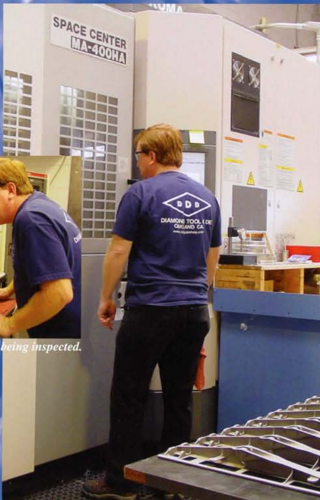
Aerospace parts being inspected.